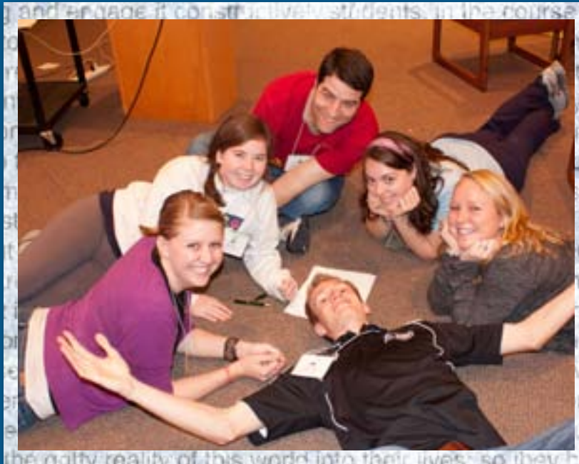
2011 Summit participants working on their sample action plan

“The ISN Summit instilled in me a profound sense that a 'little freshman' could make a positive change on campus.”