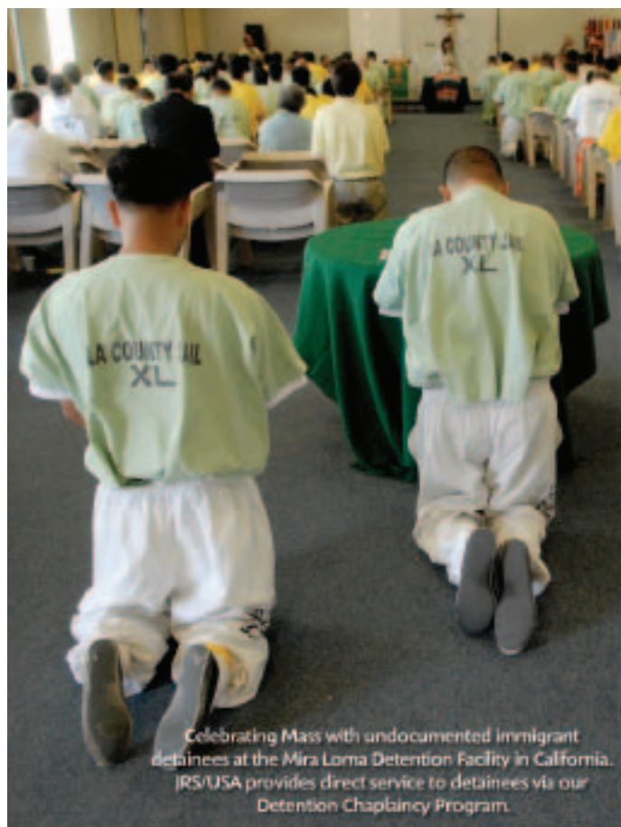
Celebrating Mass with undocumented immigrant detainees at the Mira Loma Detention Facility in California. JRS/USA provides direct service to detainees via our Detention Chaplaincy Program.